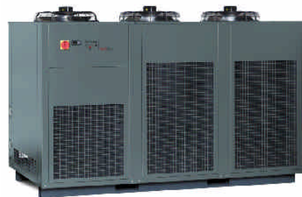
PCGE 1090 (with option colour RAL 7043, traffic grey B) PCGE 3150 with three and PCGE 3650 with four fans)