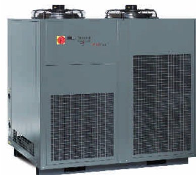
ProfiCool Genius (with option colour RAL 7043, traffic grey B)