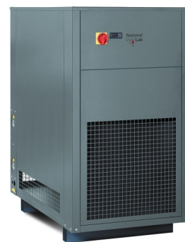
FlowCool Unicus (with option colour RAL 7043 - traffic grey B)

Additional options and accessories as well as pump alternatives on request.