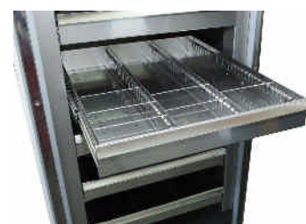
drawer with telescopic slide-out, made of CNS