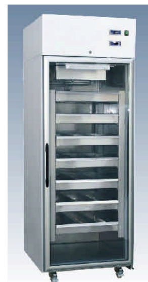
LabStar Sirius LSSI 7504GEWU