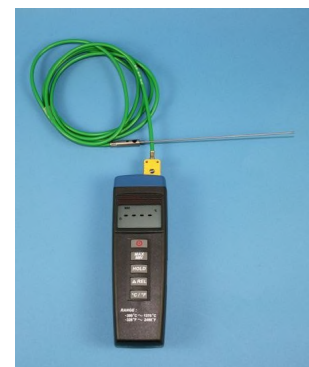
MIN/MAX digital thermometer with add. temperature sensor

Please ask for a personal fitting option.