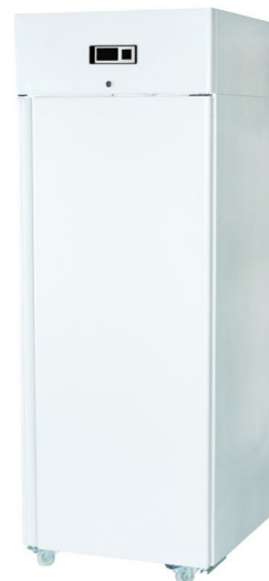
ProfiLine Pegasus PLPE6042EWU