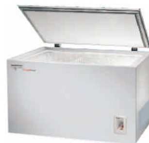
ProfiLine Pollux 3645WN