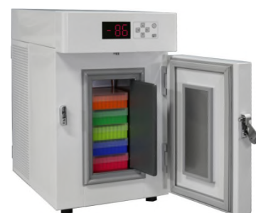
ProfiLine Pegasus PLPE 0186EWN (With accessories Inventory Systems. See sep. brochure.)