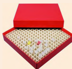
Boxes and grid dividers made of fiberboard