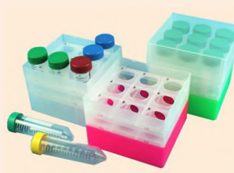
Plastic boxes made of Polypropylene