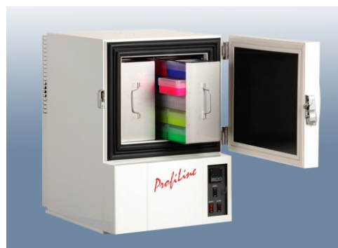
ProfiLine Pegasus PLPE 0486 (With accessories Inventory Systems. See sep. brochure.)