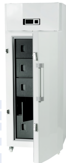
ProfiLine Pegasus PLPE 4186EWN