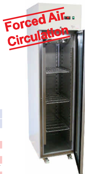
LabStar Sirius LSSI 3505GEWU