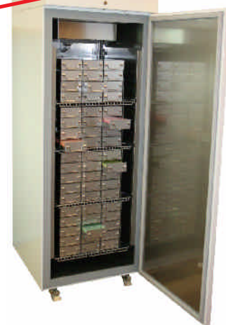
LabStar Sirius LSSI 7505EWN (With accessories Inventory Systems. See sep. brochure.)