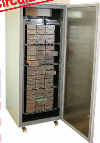
LabStar Sirius LSSI 7505EWW (With accessories Inventory Systems. See sep. brochure.)