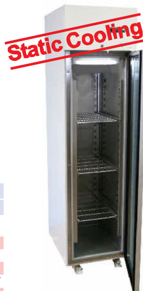
LabStar Sirius LSSI 3505GEWU